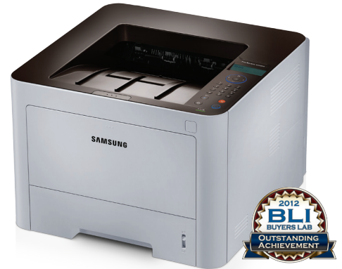
Outstanding Achievement in Innovation: Samsung Easy Eco Driver